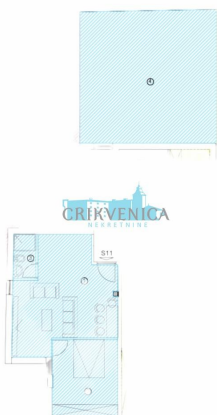
I KAT Stambena jedinica br. 11 u nacrtima označena svjetlo plavom bojom